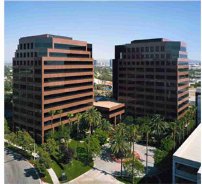
Click to View Floor Plan

Premier Business Centers is one of the largest providers of executive suites in the United States. You will be impressed with what we can offer your business. Our Premier Business Centers' South Coast Metro location at