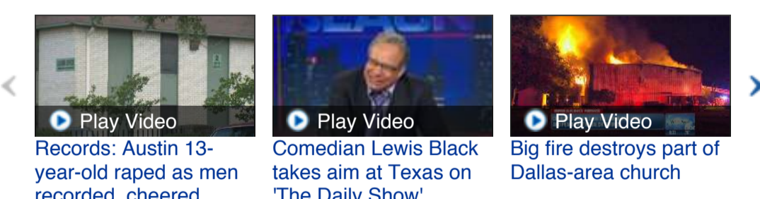
Records: Austin 13-year-old raped as men recorded, cheered