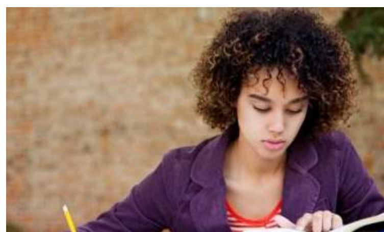
Pick the Best Student Loan Repayment Plan for You