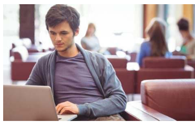
Top Student Loan Refinance Companies in 2017