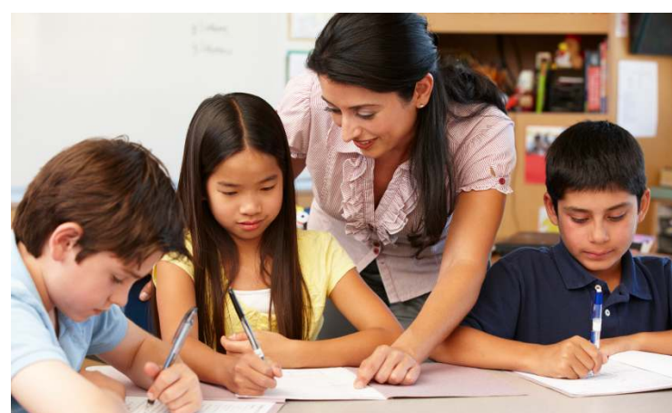
Student Loan Forgiveness: How It Works and How to Get It

We want to hear from you and encourage a lively discussion among our users. Please help us keep our site clean and safe by following our posting guidelines , and avoid disclosing personal or sensitive information such as bank account or phone numbers. Any comments posted under NerdWallet's official account are not reviewed or endorsed by representatives of financial institutions affiliated with the reviewed products, unless explicitly stated otherwise.