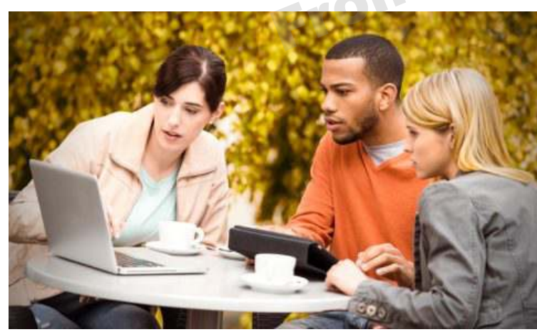
How to Pay for College: A Four-Step Guide